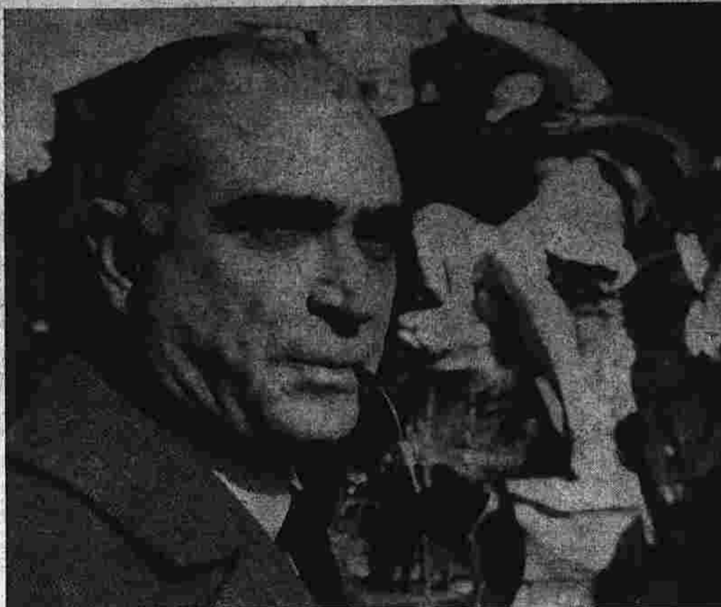
The Italians and the British make appearances next week. Luigi Barzini, above, will narrate CBS' "The Italians," a one-hour program based on Barzini's book. It will be televised Tuesday at 10 p.m. Patrick Macnee, right, stars in the British series, "The Avengers," starting on ABC Friday 10-11 p.m.

A quarter-hour has been added to the television production of Arthur Miller's "The Crucible" at the request of the playwright. The play will now run for two-and-a-quarter hours when it is presented in May on CBS. The network said the additional time makes the play the longest presented on commercial television.