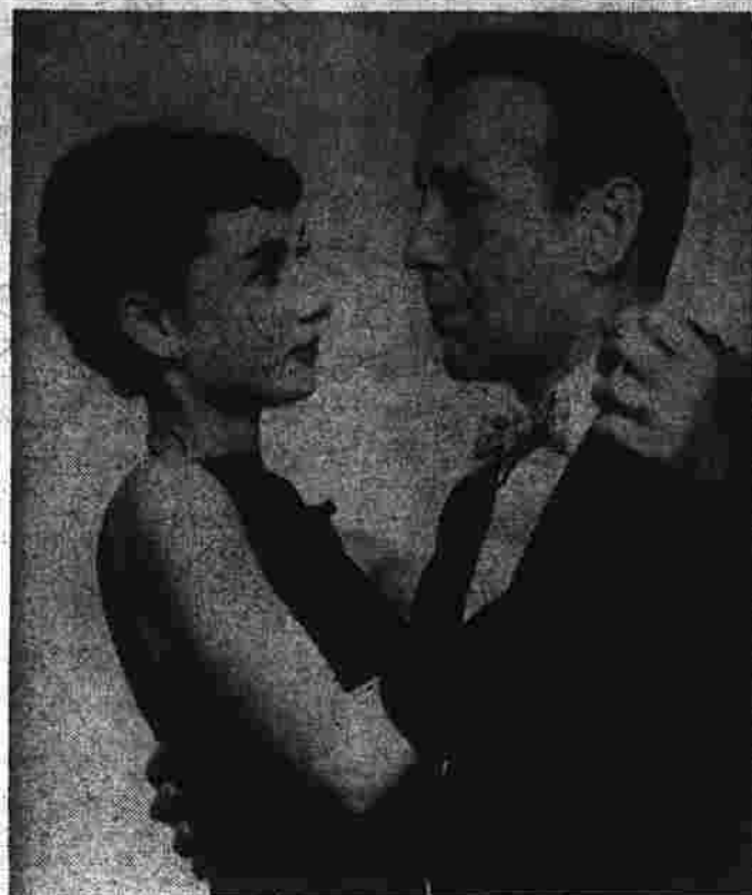
Audrey Hepburn and Humphrey Bogart star in the movie, "Sabrina," tonight at 9 p.m. on NBC.