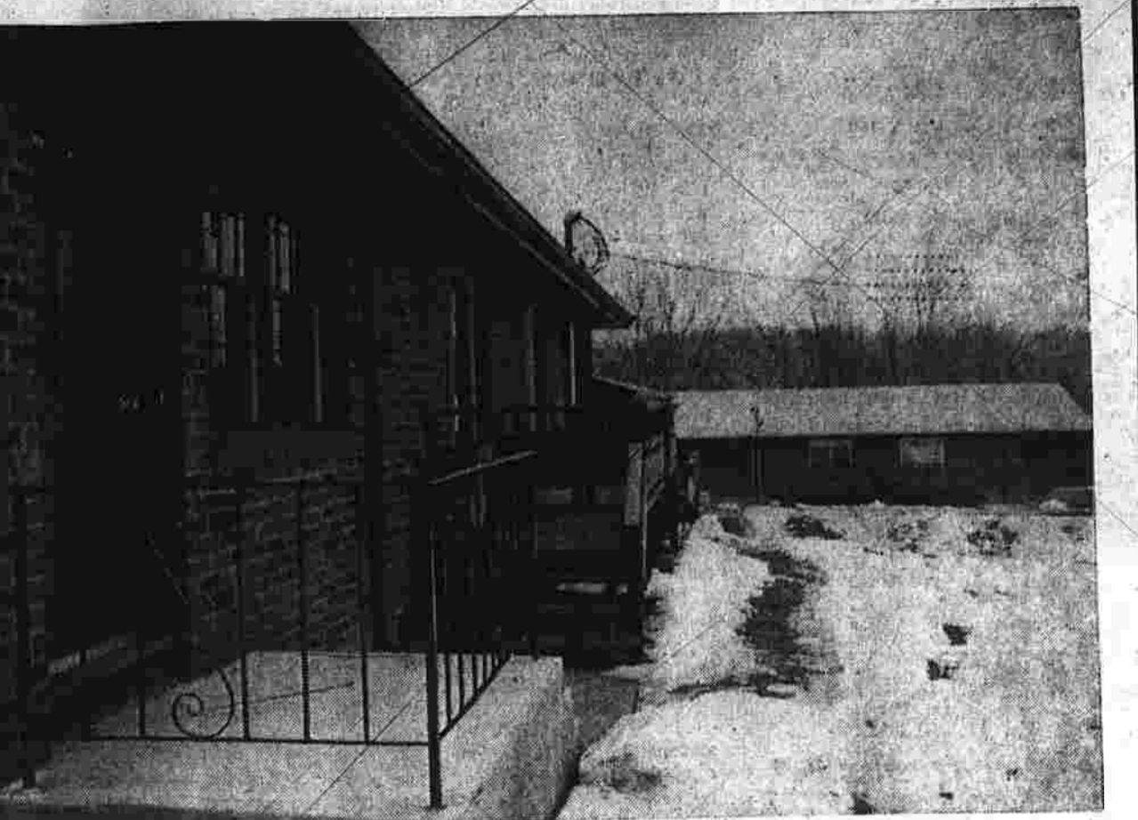
"A New Concept in Apartment Living"